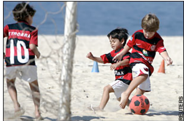
Young talent: children playing on a beach in Brazil

There are no nonsensical shouts of "Get stuck in, get it up there" or "Get rid of it". One Brazilian coach told me that the art of coaching youngsters was to try to reproduce street football on the field. At my coaching sessions, I set up small-sided games and, as much as possible, let the young players do what they like doing most - playing. In essence, I orchestrate an environment to resemble street football. I point out strongly that I have no problem with them making mistakes and I insist that they be confident and try things.